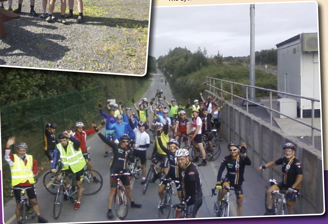
The cyclists bunch up at a level crossing