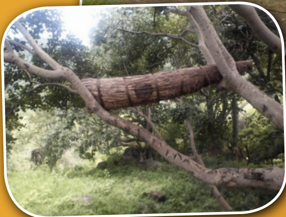
Julius worked on bee-keeping projects during his placement – this is an example of a local bee-hive.