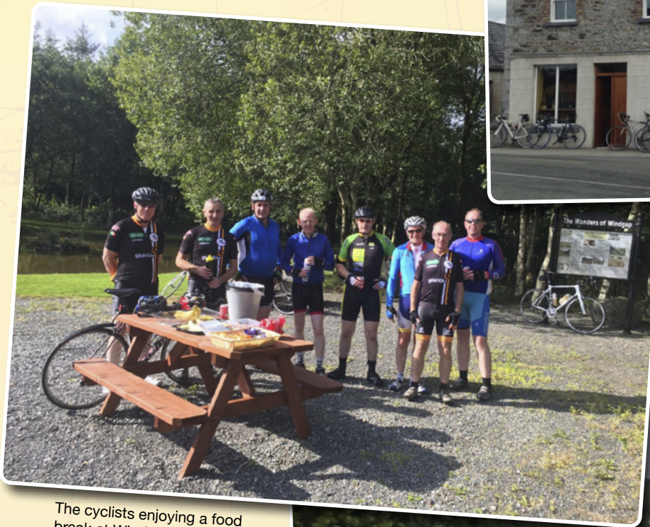
The cyclists enjoying a food break at Windgap picnic stop