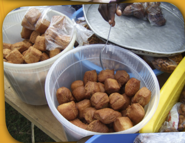
Some breads and biscuits made from cassava flour.