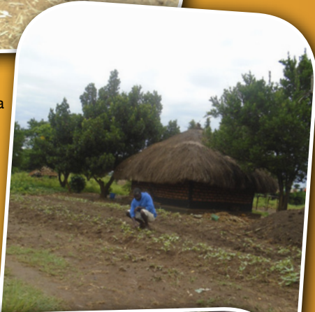
Solomon working in a kitchen garden