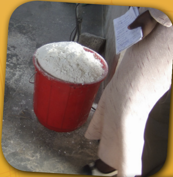
A bucket of cassava flour