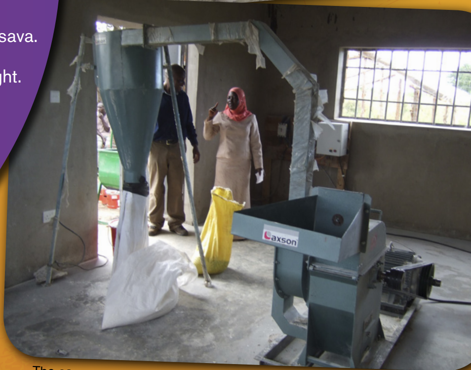
The cassava processing machine. The dried cassava chips are poured in to the machine on the right and the cassava flour emerges from the funnel on the left and is bagged.