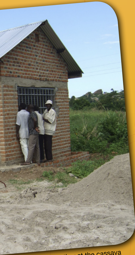
Farmers gather at the cassava plant for its opening