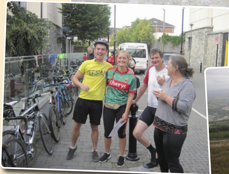
“Team Fabby” from Westport get their bikes in order.