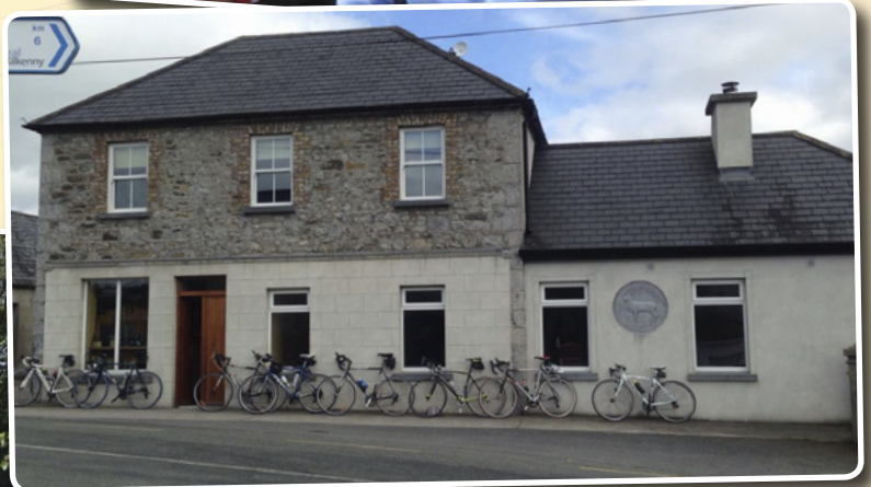
How do the cyclists always manage to find a pub????